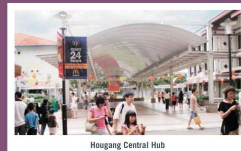
Hougang Central Hub